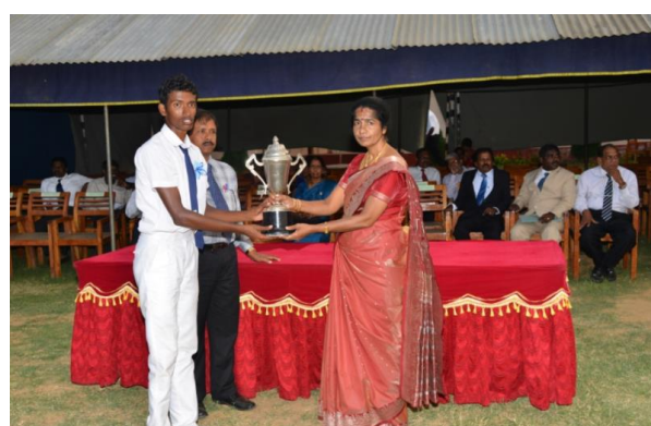
Annual Inter-House Athletic Meet Photos