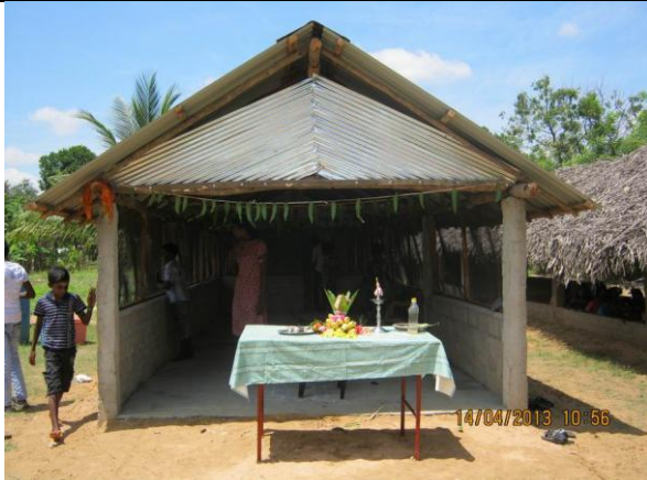
Photo Album https://picasaweb.google.com/109897446561147973343/SVECCCommunityHall1442013