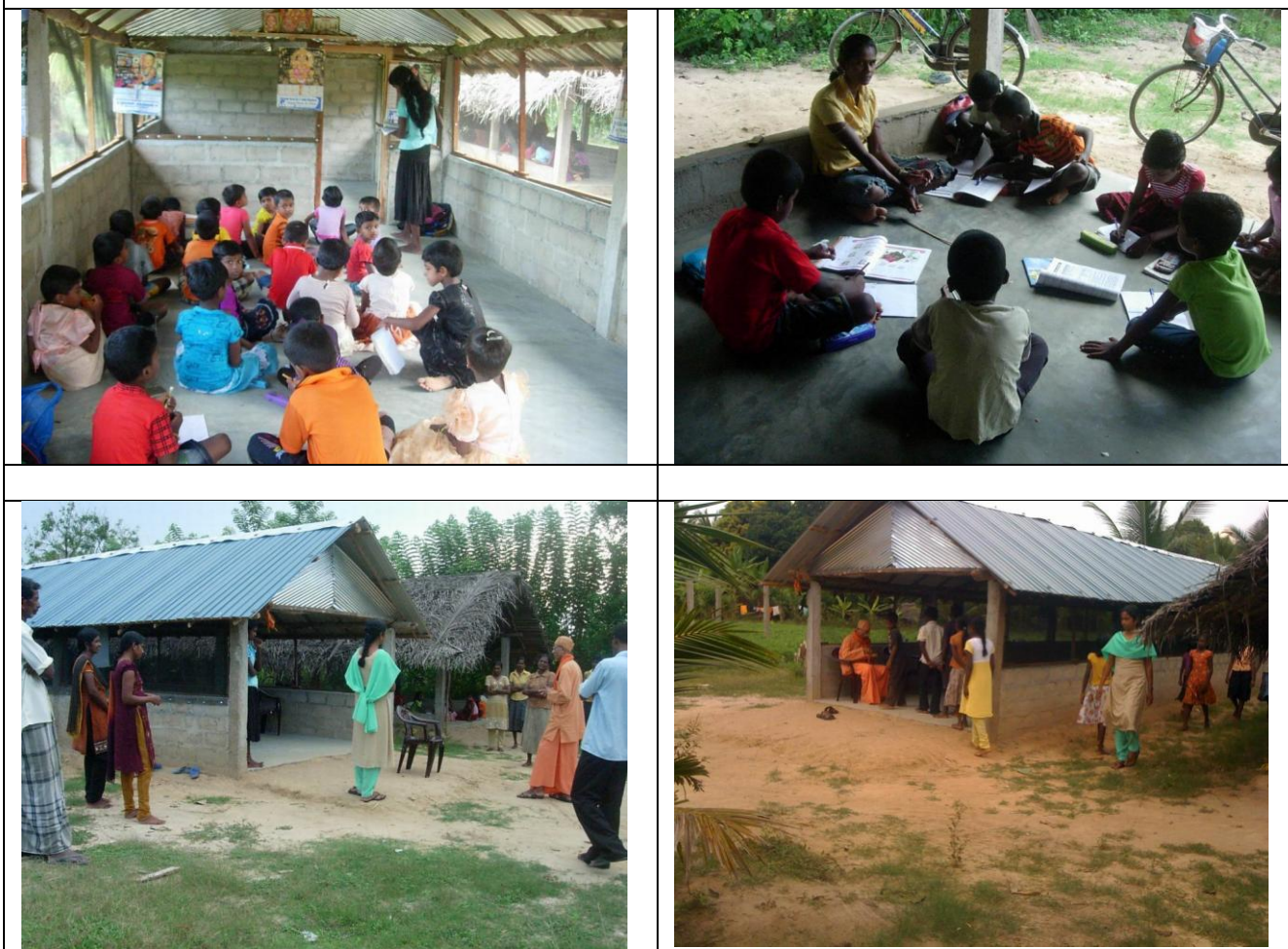
Photo Album https://picasaweb.google.com/109897446561147973343/ClassesInProgress2642013